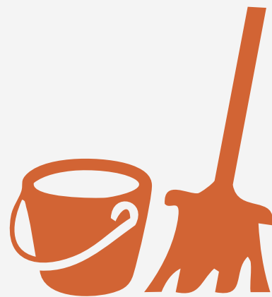
Domestic and services workers