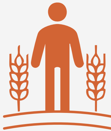
Seasonal/ agriculture workers