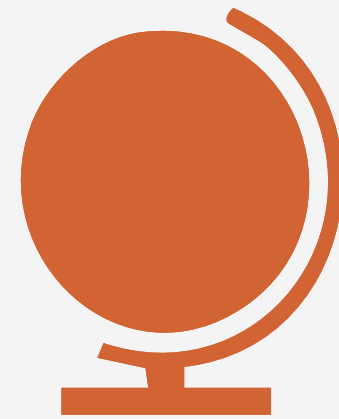
Migrant workers and refugees