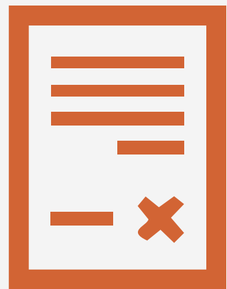
Contract and agency workers